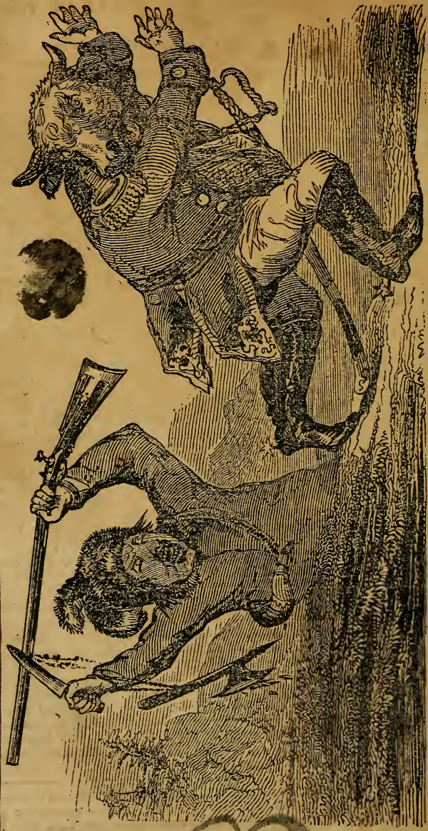
THE GHOST OF CROCKETT SCARING JOHN BULL FROM OREGON.